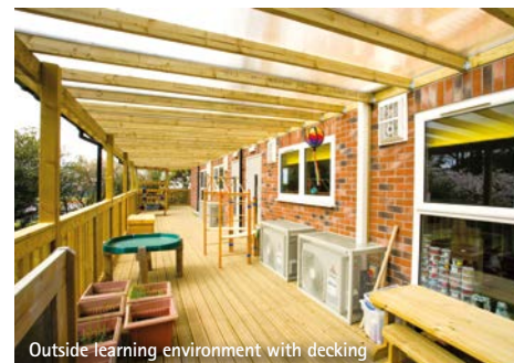
Outside learning environment with decking

For more information please visit our website www.modulek.co.uk or call 01202 813121