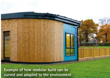
Example of how modular build can be curved and adapted to the environment